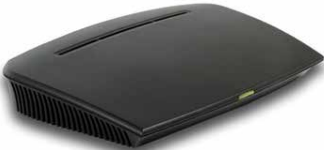
Konftel IP DECT 10